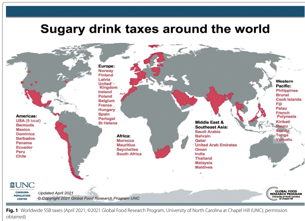
Fig. 1 Worldwide SSB taxes (April 2021)

BMI body mass index, CHD coronary heart disease, CVD cardiovascular disease